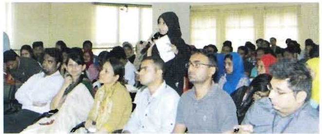
Question and answer session of CV writing and interview skills workshop