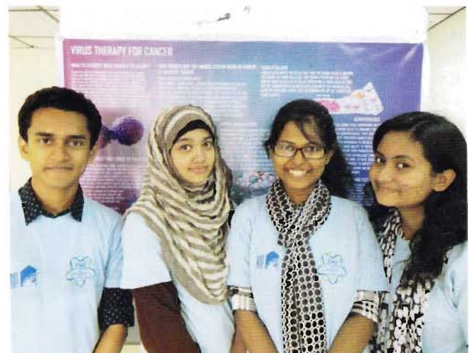
GEB Department Students in front of the recently presented poster on the current topic "Oncolytic Viruses". The students are wearing the new GEB club shirts.