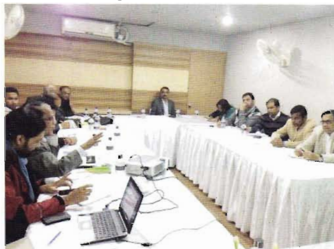
National Consultation on Valuing Ecosystem Services