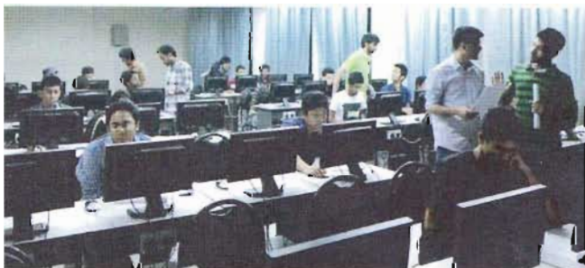
Trainer Along with EWUBC participants

EWUBC comes up with a routine schedule of sessions and workshops every semester. In Spring 2015 the club successfully coordinated a workshop on Advance MS Excel that has enlightened the students sustained the growth of the club.