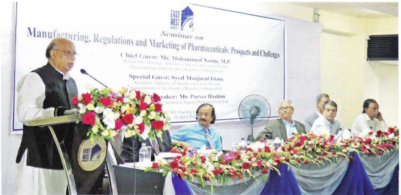
Health Minister Mohammed Nasim delivering his speech at the seminar