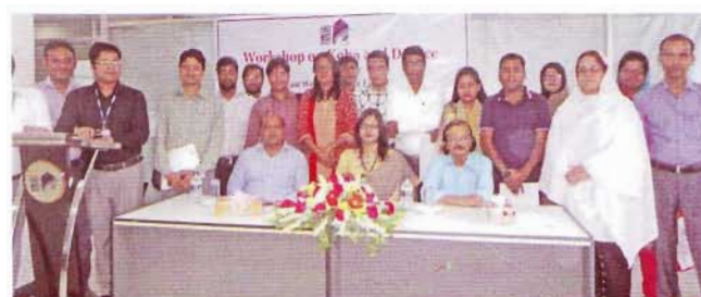
Group photo with participants and Chief Guest