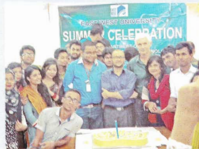
Students and teachers of GEB department in Summer 2015 celebration

Three new full-time faculty members have been recruited for the GEB department who will be teaching from Fall Semester 2015. The GEB Department has opened the door of Molecular Biology laboratory for students from Summer Semester 2015 and it is continuing to purchase more equipments. Moreover, the department is going to purchase couple fermentors very soon that will enable to initiate some biotechnological problem oriented research works in the context of Bangladesh.