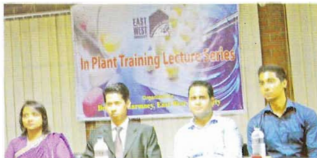
Speakers at the Inplant training Lecture