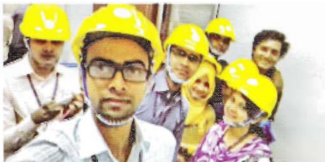
Students of the Pharmacy Department at Beximco Pharmaceuticals Ltd. (Inplant Training Program)