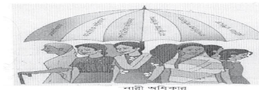
Fig. 3. All women regardless of age, religion and ethnicity under one umbrella of development (Patwari et al. 84)

for 'equality' for women since its first constitution in 1972. The book provides illustrations of women under the umbrella of development (see fig. 3).