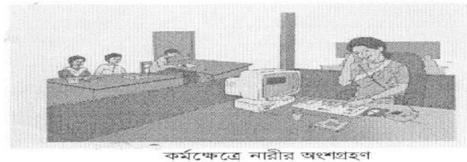
Fig. 5. Equal participation of women in workplace. (Patwari et al. 86)

enshrined secular Human Rights for its both male and female citizens in every aspect of society. The book also features an illustration (see fig. 5) of women working in an official environment.