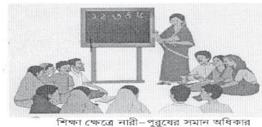
Fig. 4. Equal rights of education for men and women. (Patwari et al. 85)

The book also presents an illustration of an adult education class where women, regardless of age and gender, can receive education side by side with men (see fig. 4).