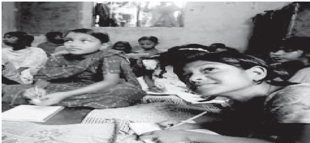
Fig. 1. Deprived children are receiving education.