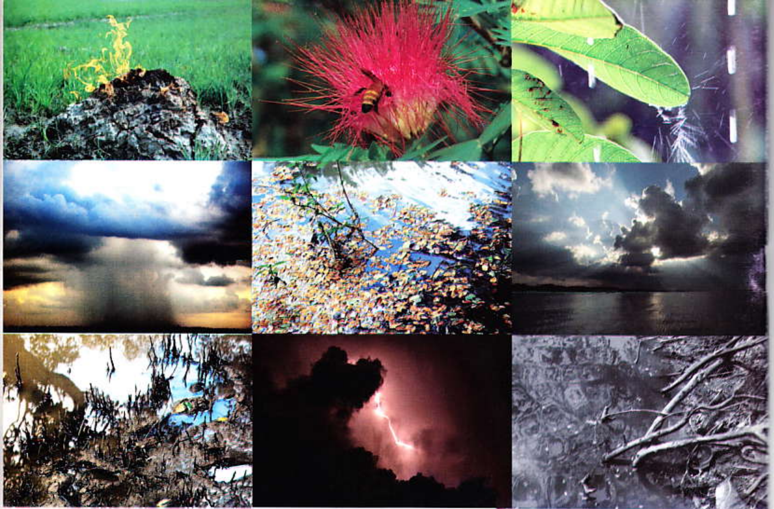
Cine & Photography Club