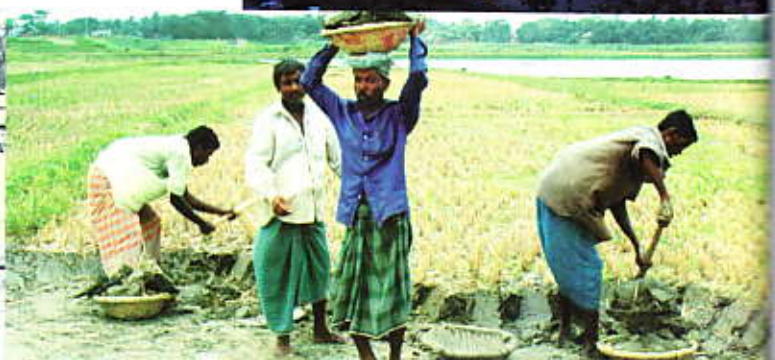
Cine & Photography Club