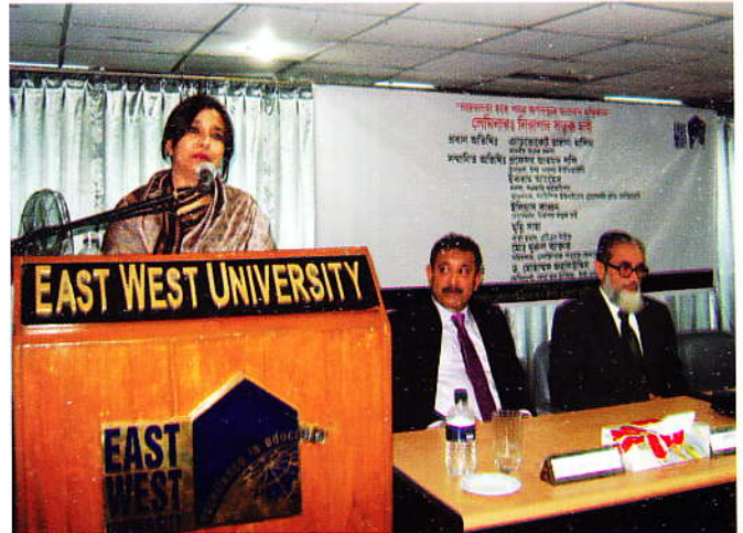
Advocate Tarana Halim, Member of Parliament, was delivering speech on "Road Safety" on 30 November at the auditorium of East West University.

a recent road accident on Dhaka- Aricha highway in Manikganj. She expressed her personal attitude in protesting the events of road accident, and in bringing changes in reporting such events in media on behalf of the victims. Students, teachers and administrative personnel of EWU listened to the speeches and took the event seriously with a pledge to unite on creating safe road in Bangladesh.