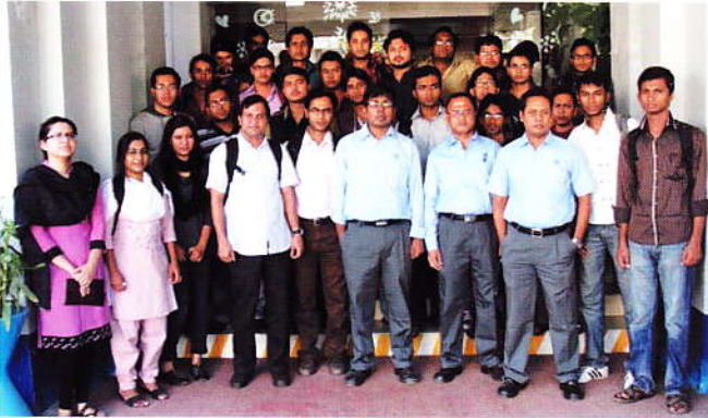
Students and faculty members of the EEE department visiting the factory of Unilever Bangladesh at Kalurghat, Chittagong on a study tour.