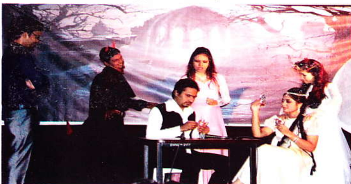
Students performing in "The Rape of the Lock" staged by the English Conversation Club on 3 October, 2013

East West English Conversation Club has been a very popular and successful club in its activities and objectives. The main objective of this club is to make students fluent in English. So, the club arranges different kinds of chat sessions, public speaking sessions and workshops. Its motto is "we try to keep you thinking..."