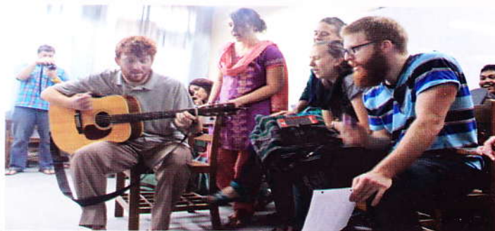
Students from U.S.A. along with the students from East West University participated in "Cultural Exchange Program" on 6 June, 2013