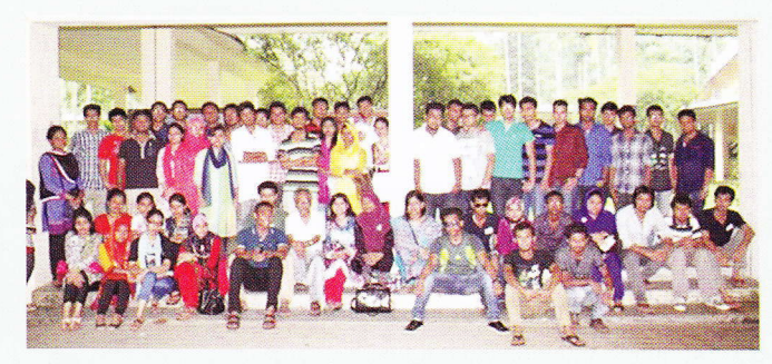
All students and faculty members in survey

field site-a village named "Barai" in Laksam Upazilla. They collected information from 85 households selected by students using simple random sampling based on the existent sampling frame of the village. This survey gave them hands on experience in data collection process. The next step of this survey is to analyse the data and publish a monograph.