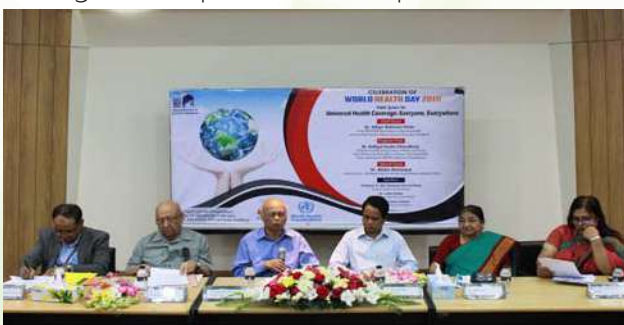
Speakers of World Health Day 2018 Seminar