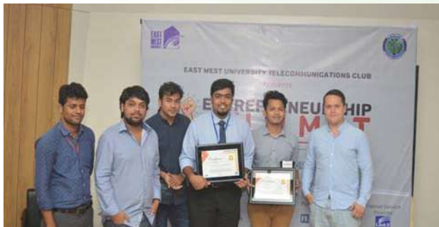
Entrepreneur Summit 2018