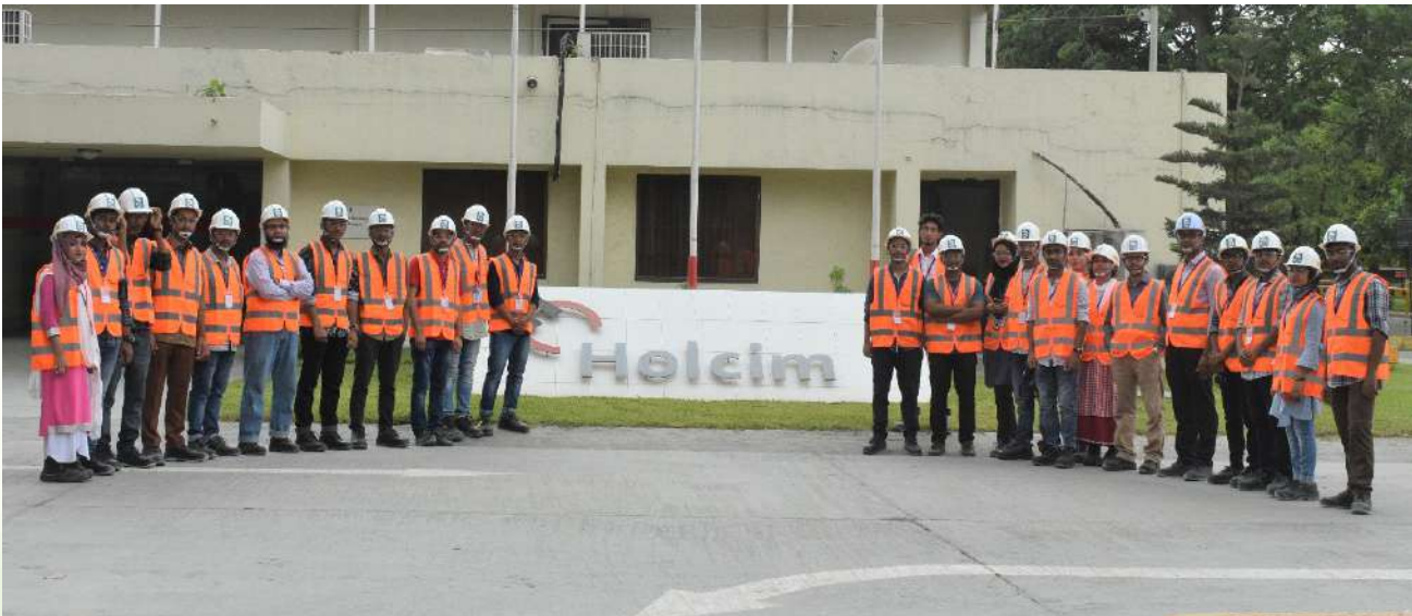
Study tour of Holcim Cement (Bangladesh) Ltd., plant at Meghnaghat, Narayanganj

The Department of Civil Engineering arranged a study tour on 17 July 2018 to Holcim Cement (Bangladesh) Ltd., Meghnaghat, Narayanganj for students enrolled in the Engineering Materials (CE 201) course. A total of 24 students along with three faculty members visited one out of three cement factory plants (Plant-1) of Holcim group. This visit, comprised of both presentations and on-site visits to different machineries, offered students an excellent opportunity to be familiarized with different steps of the manufacturing process of cement. Experiences gained from this tour will enable students to combine theoretical knowledge with practical experience.