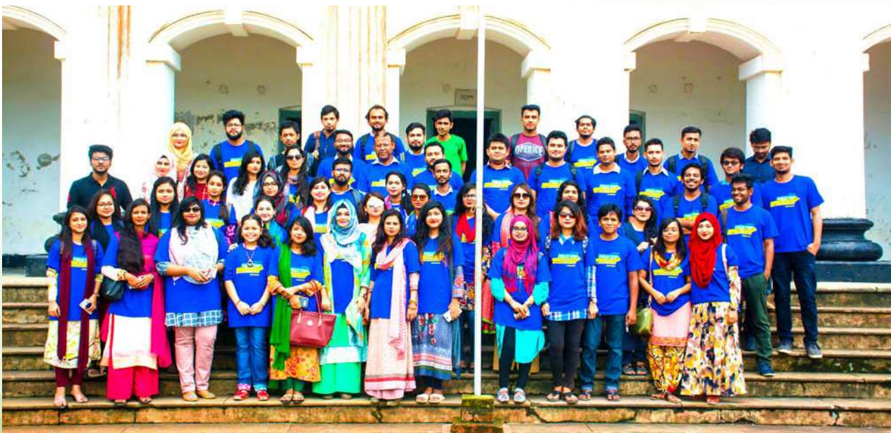
Field Trip organized by Economics Department